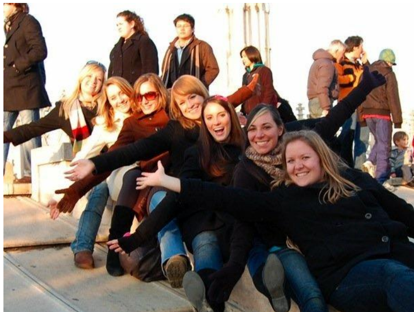
The UCF girls on a weekend trip to Milan

I would highly recommend the study abroad program to any Rosen College student who is considering it. It was, hands down, the greatest experience of my years in college. And who knows, you may just discover something about yourself during this experience that will lead you to your future career! Bonne chance!