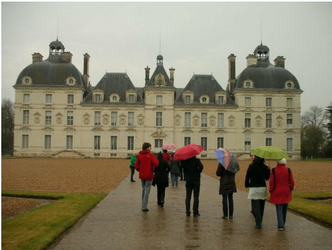
One of our class "field trips"