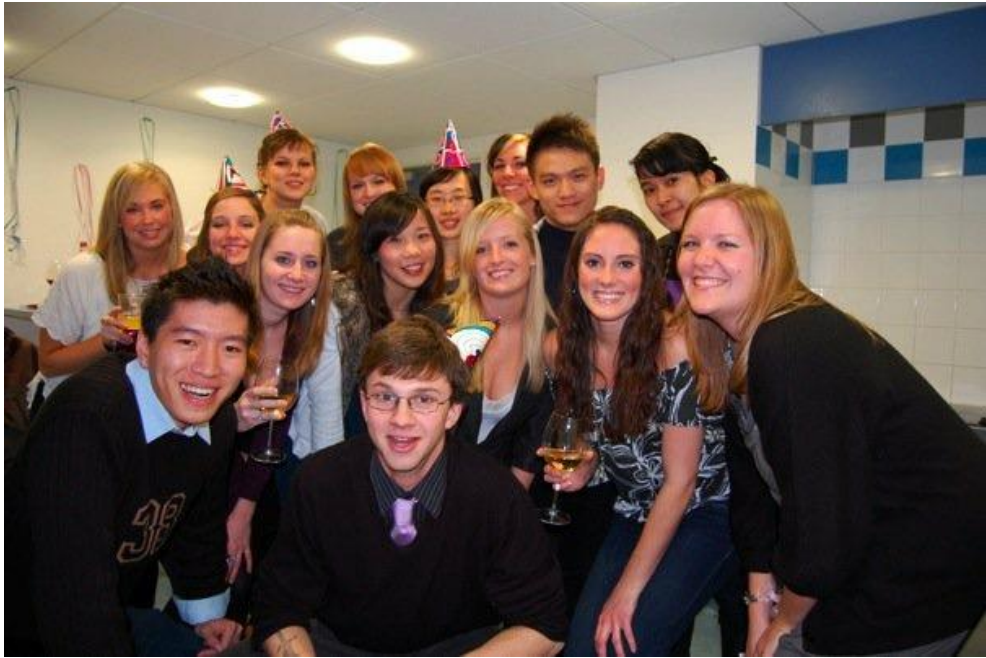
Our international class in the dorm kitchen