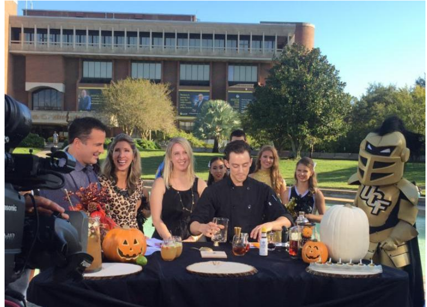
Rosen College stirred up fall cocktails for FOX 35's morning show, which aired live from UCF on Oct. 23. Get the recipes.