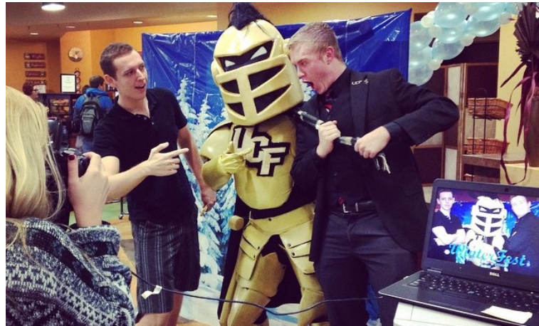
Knightrö posed for photos with students on Nov. 18 during Rosen College's WinterFest, a winter-themed festival on campus.