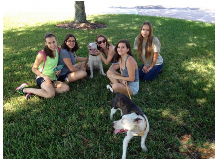
Students brought furry friends to campus for the Rent-a-Pup fundraising event on Nov. 2, benefiting Greater Orlando Children's Miracle Network Hospitals.

Rosen College Trains Dubai Theme Park Leaders for Major Attraction Opening