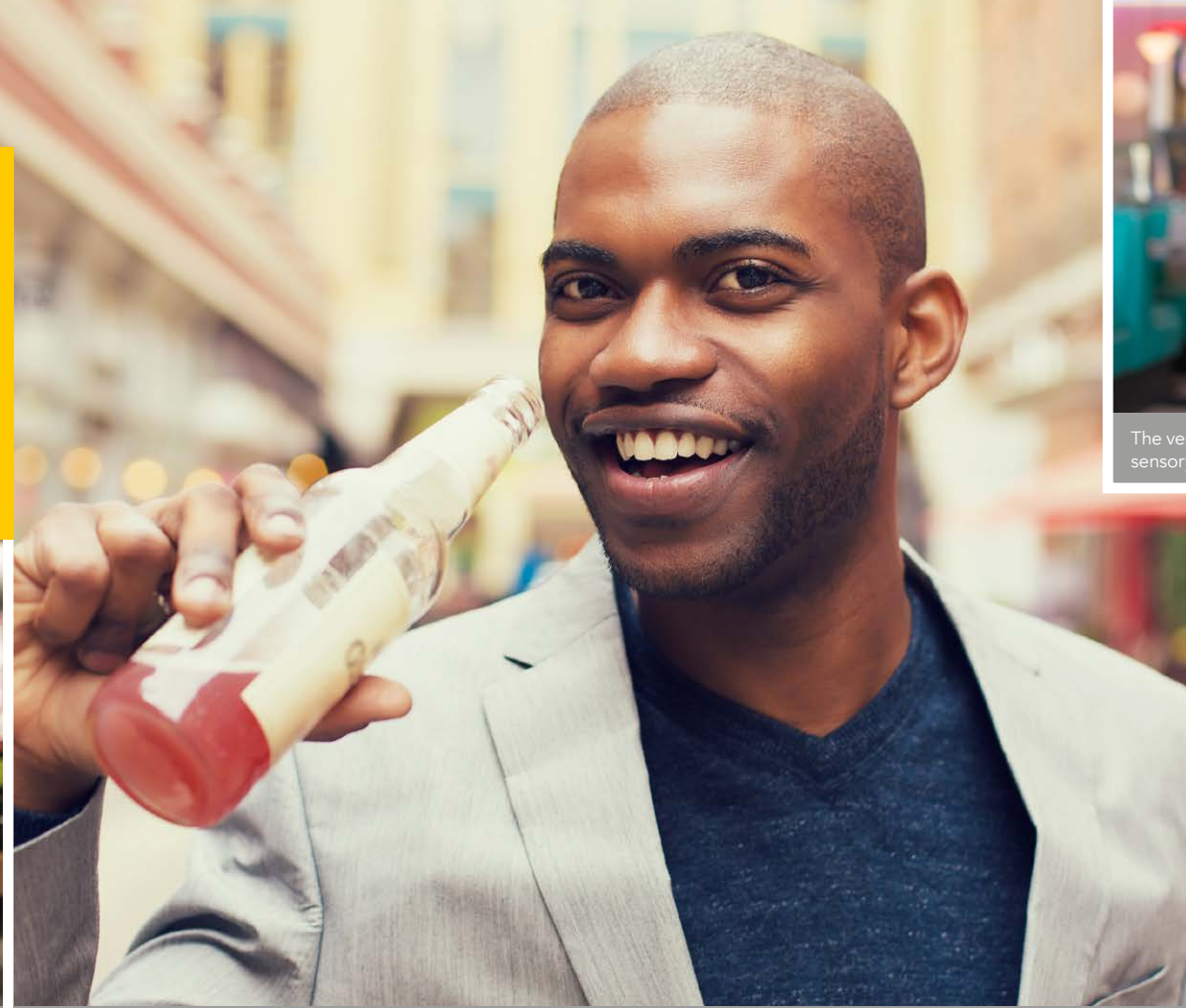
Customers rate the taste of drinks served in a glass bottle highly and so are prepared to pay more for them.