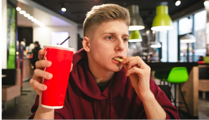
Consumers have lower expectations of taste when drinks are served in flimsy cups.