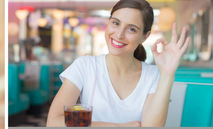
The vessels in which drinks are served can lead to different sensory perceptions.

Based on their reaction to the images alone, participants were asked about their expectations of the drinks' taste, deliciousness and flavor, rating each measure on a seven-point scale. They were also asked how much they would be willing to pay for each drink.