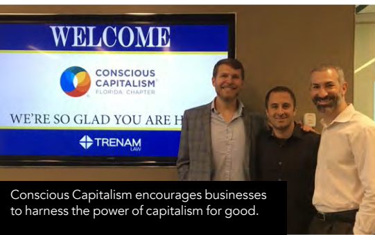
Conscious Capitalism encourages businesses to harness the power of capitalism for good.