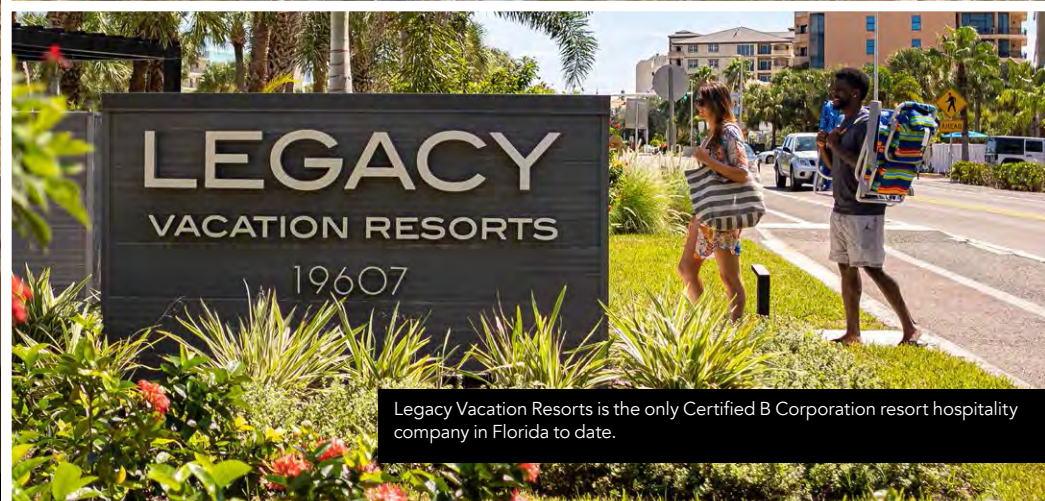
Legacy Vacation Resorts is the only Certified B Corporation resort hospitality company in Florida to date.

damage caused by red tide in Florida and its negative economic impact on large parts of the hospitality and tourism industry. In Colorado and Nevada, the negative impacts are caused by extreme dry heat, droughts and wildfires with serious impacts on the quality of air we breathe posing problems for those on vacation. In the winter months the changing climate is contributing to a shortening of the ski season so it is not just the summer months where the challenges of climate change are real.