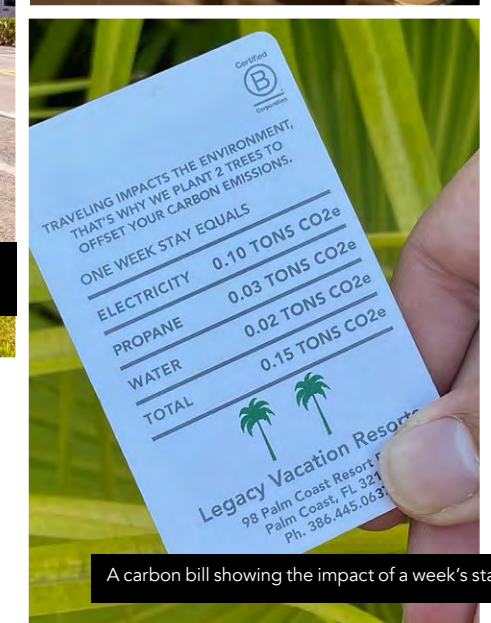
A carbon bill showing the impact of a week's stay.

that this is solely a people problem as much as it is a system-wide problem with education of consumers and workers contributing to positive change. This is one of the reasons why we launched "Florida For Good" as a means to raise awareness and levels of engagement. The younger generation is clearly grasping the need for change, they see it with their values changing and for many, change can't come fast enough. Despite Florida being the third most populous state in the country, people are largely unaware of what business really can do to change the world for the better. Hopefully "Florida For Good" and the younger generation can change things in the future.