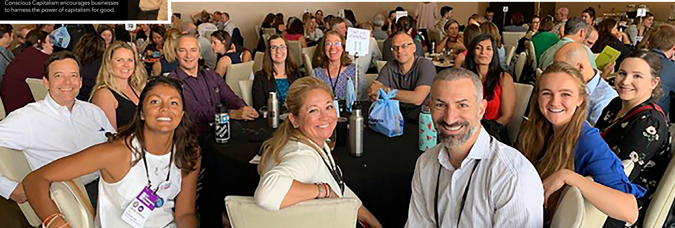
At a recent event.