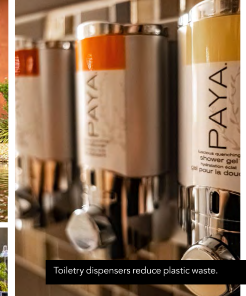
Toiletry dispensers reduce plastic waste.

B Corporations are committed to inclusive, equitable, and regenerative economic systems.