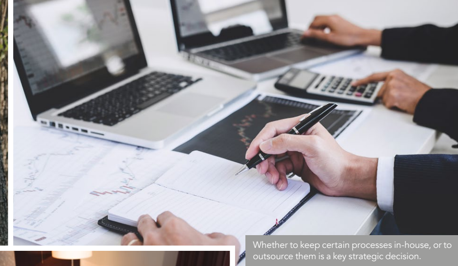
Whether to keep certain processes in-house, or to outsource them is a key strategic decision.

ONCE A COMPANY HAS A STRONG UNDERSTANDING OF THEIR RESOURCES, THEY ARE THEN ABLE TO ADAPT TO CHANGING EXTERNAL DEMANDS MORE EASILY AND THUS IMPROVE THEIR CHANCES OF BEING SUCCESSFUL.