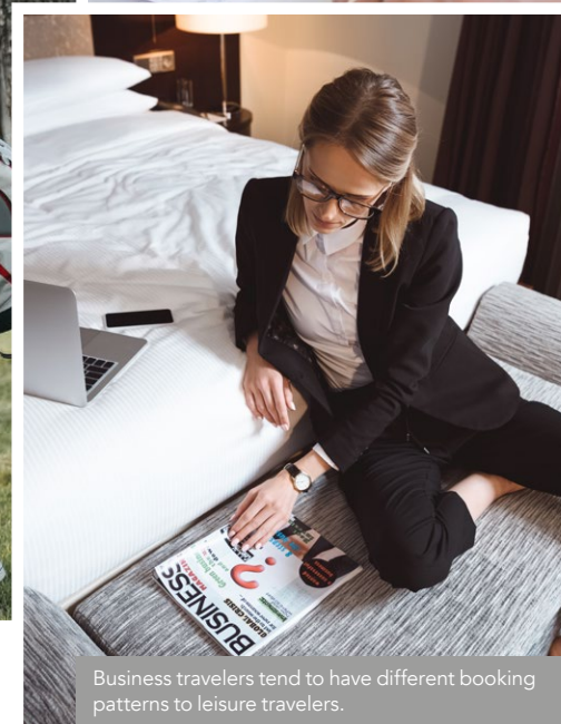
Business travelers tend to have different booking patterns to leisure travelers.

decision: whether or not to keep the process in-house. Accurate and effective revenue management requires vast quantities of data, including items such as past and current bookings, weather forecasting and even events such as golf tournaments. This then needs expert analysis to create a predictive model that can inform decisions regarding pricing and supply strategies.