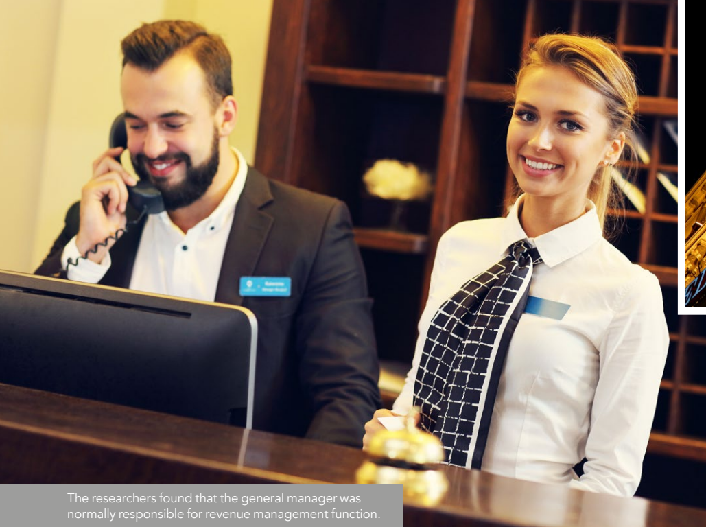
The researchers found that the general manager was normally responsible for revenue management function.