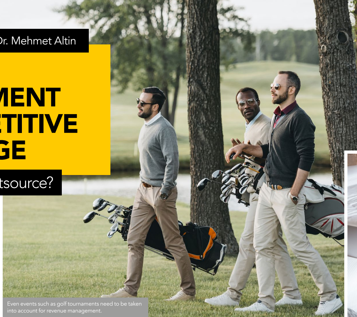
Even events such as golf tournaments need to be taken into account for revenue management.

management, inasmuch as they are both methods which aim to maximize profit for a business. Revenue management is, however, far more in-depth as it relies on advanced data analysis to predict the industry's supply and demand.