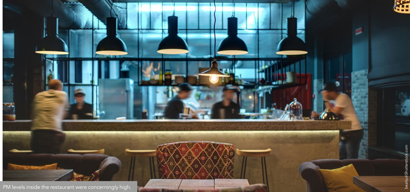
PM levels inside the restaurant were concerningly high.

To do this, Dr. Okumus and the rest of the team conducted a series of field tests assessing the concentrations of PM 10 and PM 2.5 , two types of invisible matter known to cause severe respiratory diseases, inside the dining room of a chain-operated, open-kitchen restaurant. Concurrently, the team also measured the levels of PM immediately outside the restaurant, so that they could later compare the data recorded with that taken inside the dining room.