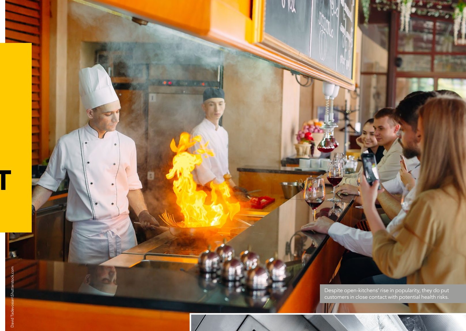
Despite open-kitchens' rise in popularity, they do put customers in close contact with potential health risks.

PAST STUDIES HAVE FOUND THAT COMMERCIAL COOKING CAN PRODUCE FUMES THAT HAVE ADVERSE HEALTH EFFECTS ON HUMANS.