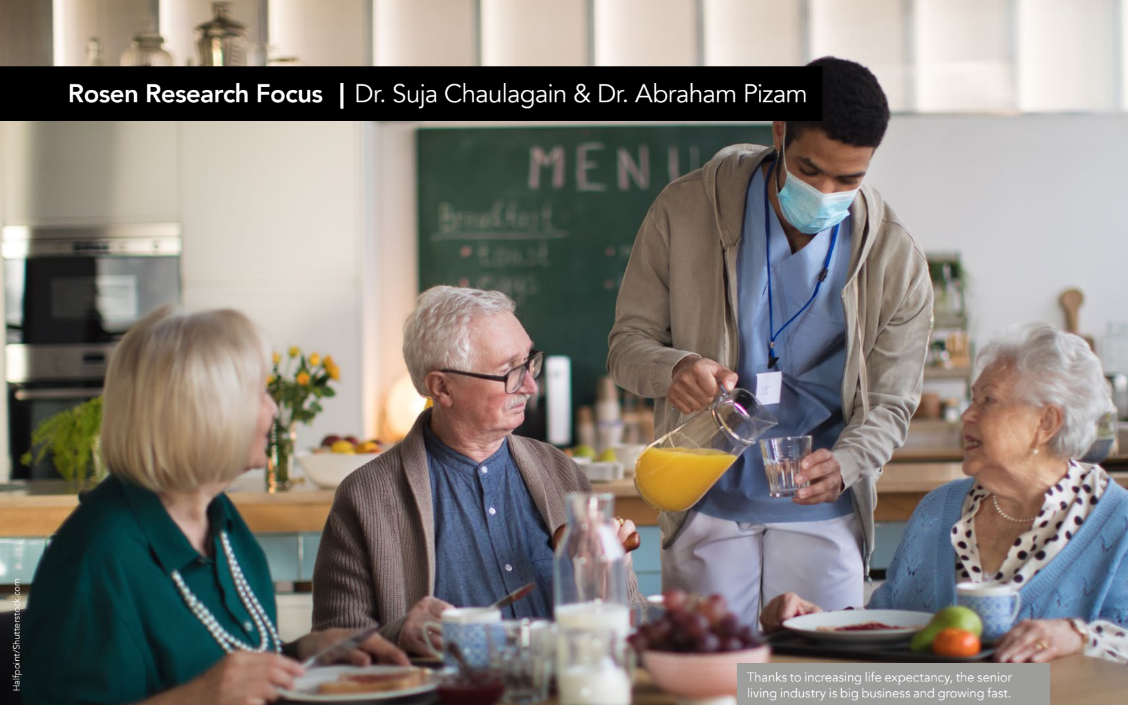
Thanks to increasing life expectancy, the senior living industry is big business and growing fast.