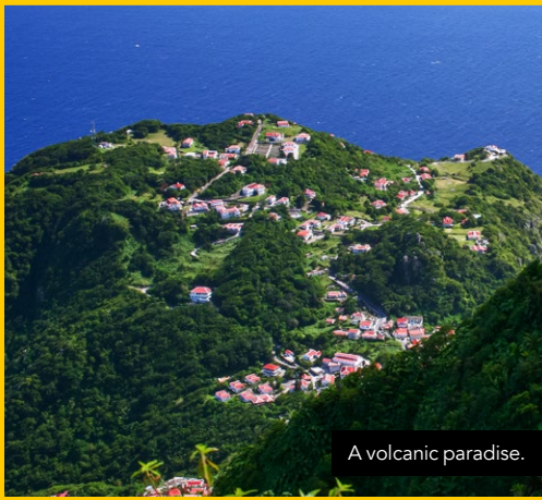
The island of Saba is approx. 5 square miles.